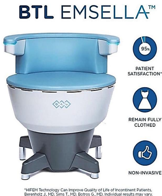
Fig. 2. BTL Emsella™